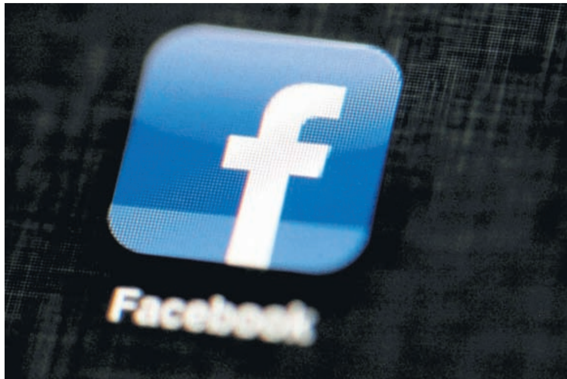
In this May 16, 2012, file photo, the Facebook logo is displayed on an iPad in Philadelphia.

Yesterday's Cryptoquote: IT IS WONDERFUL HOW MUCH MAY BE DONE IF WE ARE ALWAYS DOING. — THOMAS JEFFERSON